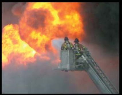
A Safe Community <mark>IS</mark> Affordable.